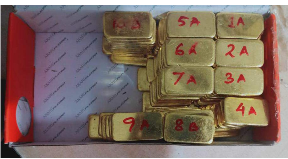
Above product images are for illustrative purposes only and may vary from the actual product. MMTC shall not undertake any responsibility if the actual product is different from the product image.