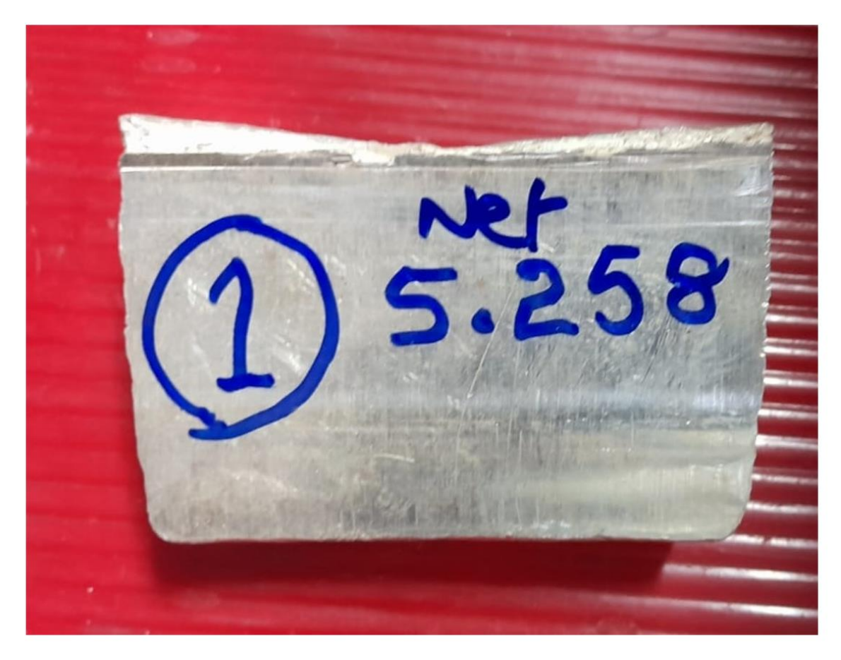
Package No. 1 – 5.258 kilos of 1 (one) Silver Block (99.9% finesse)