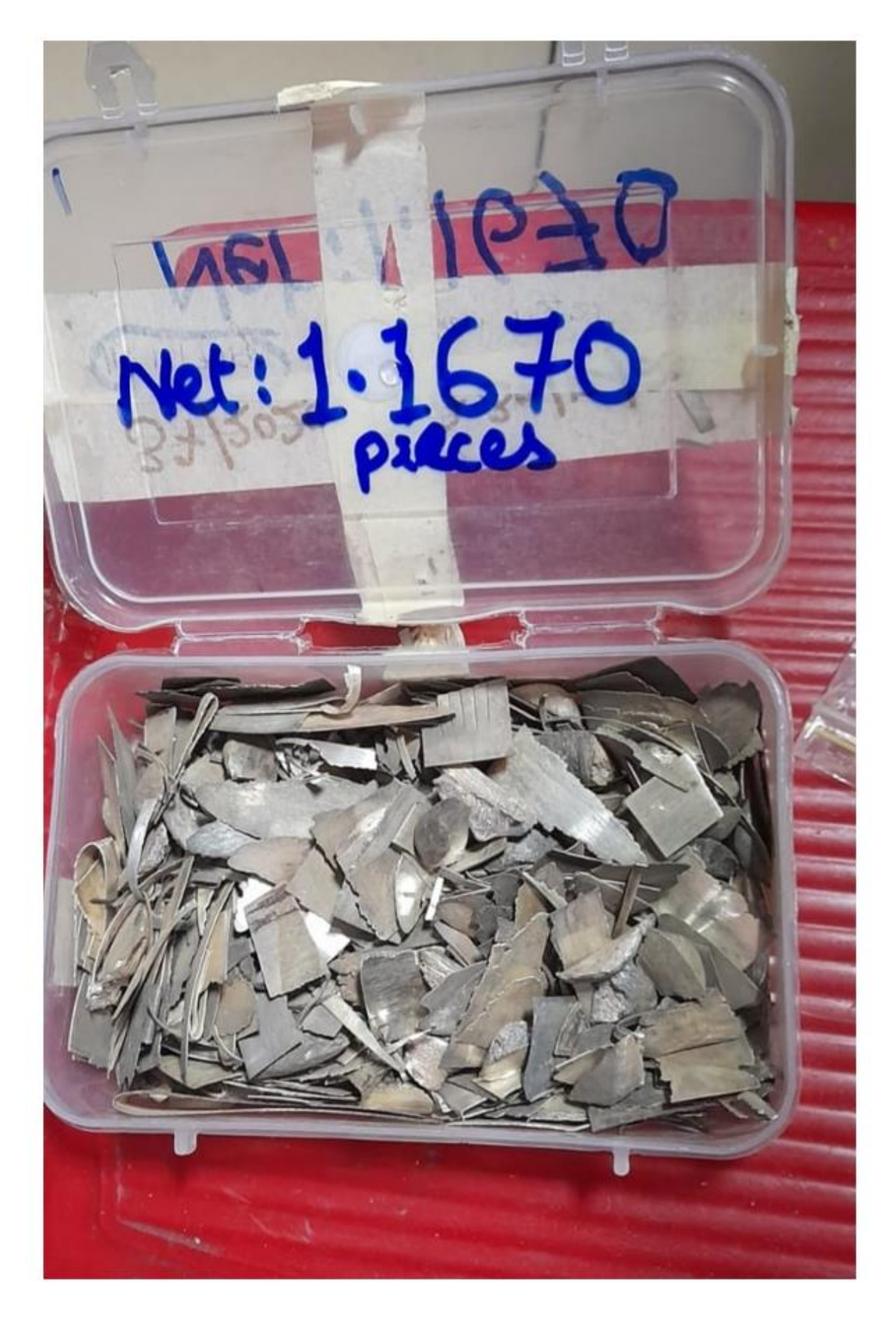
Package No. 5 – 1.1670 kilos of Silver Pieces (95% finesse)