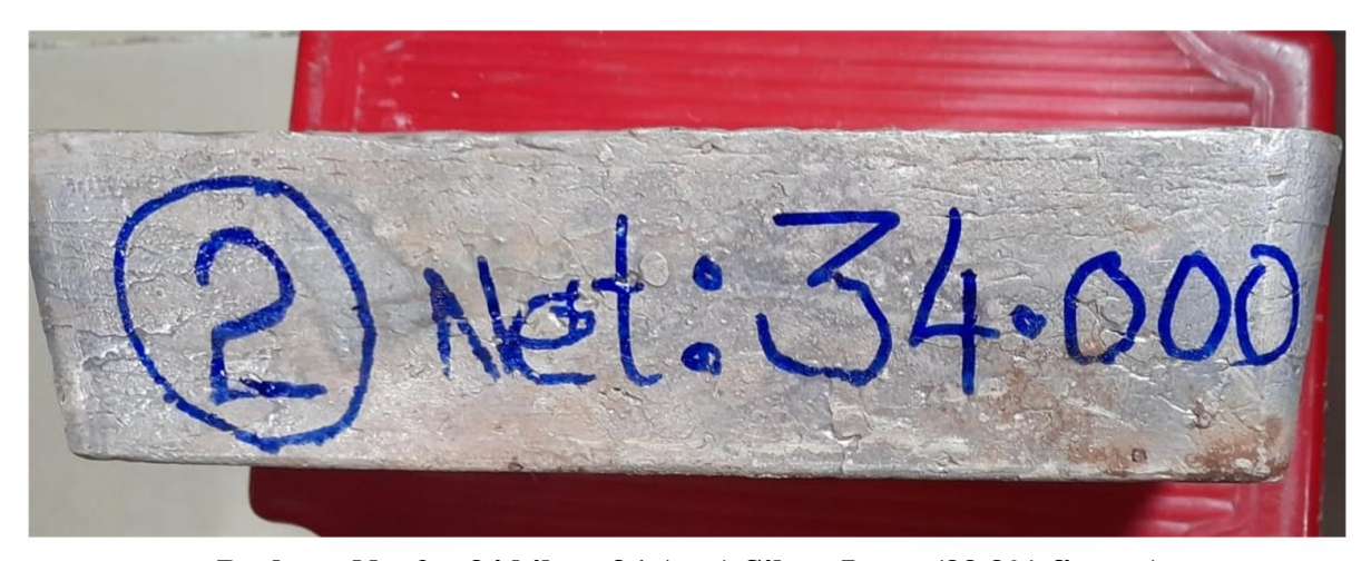
Package No. 2 – 34 kilos of 1 (one) Silver Ingot (99.9% finesse)