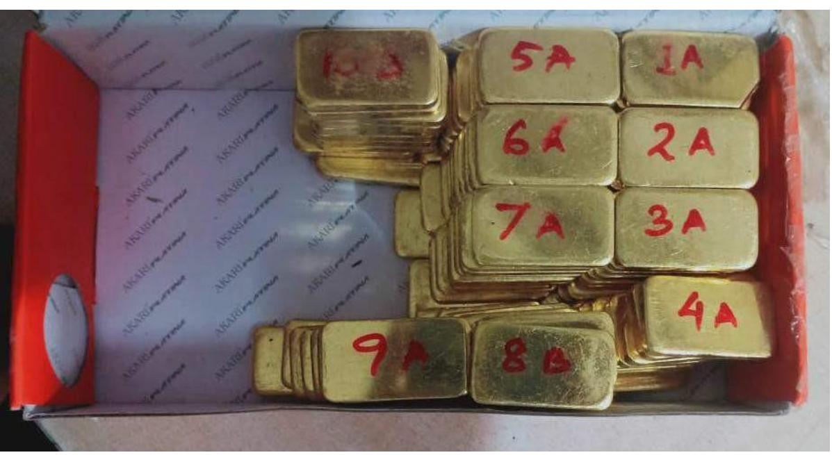
Above product images are for illustrative purposes only and may vary from the actual product. MMTC shall not undertake any responsibility if the actual product is different from the product image.