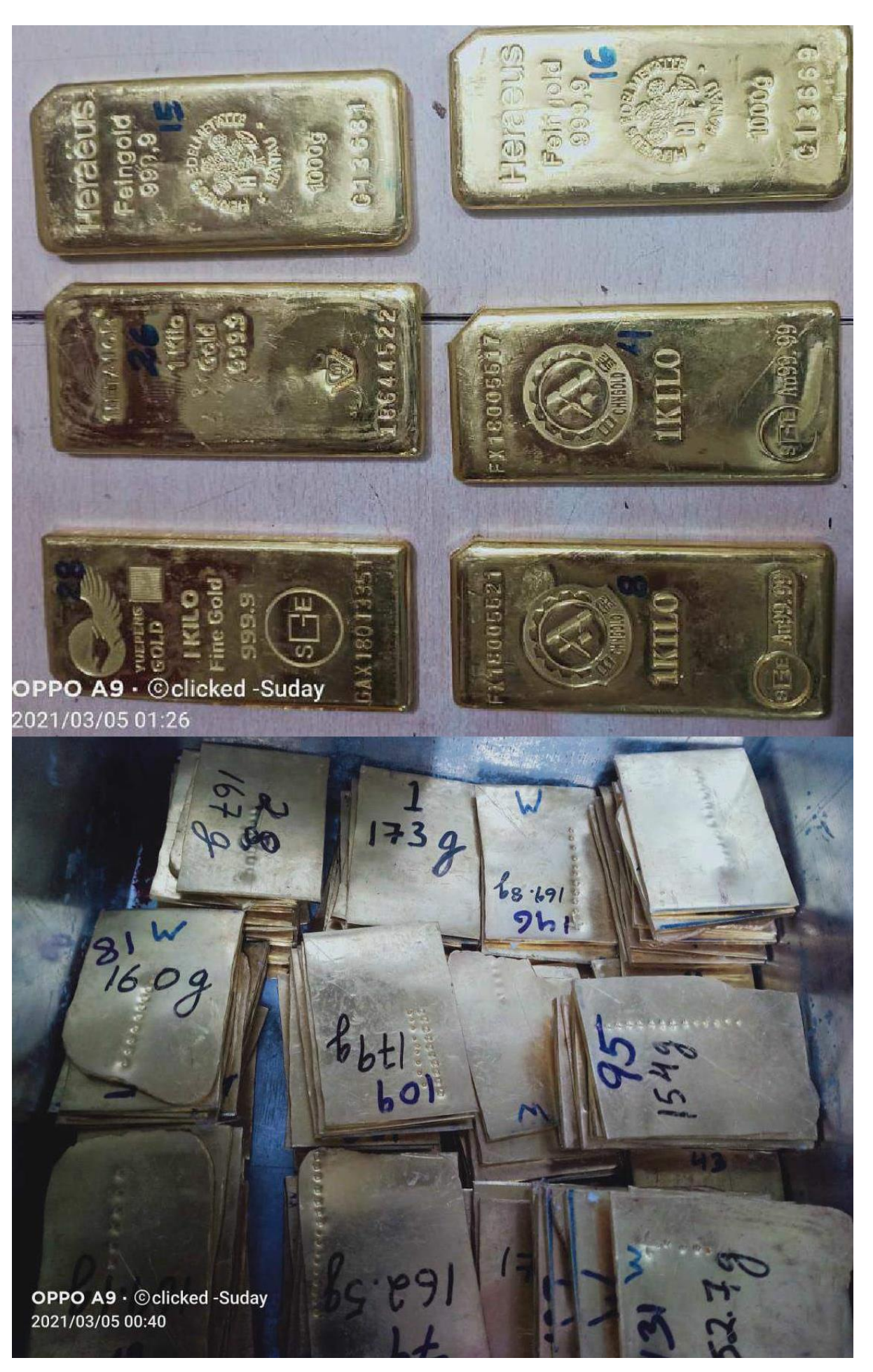
MMTC/VIZAG/GOLD /2020-21/01 Dated: 30<sup>TH</sup> March,